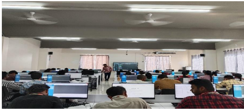
22-03-2024, 9:20 AM – 12:40 PM (AI&DS: Room No.7110)