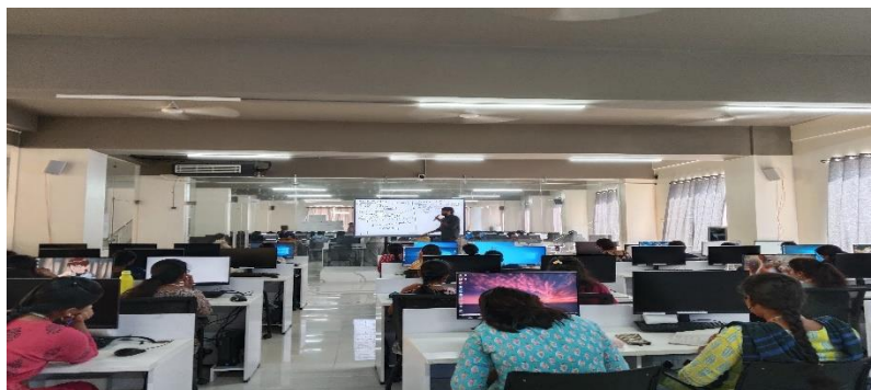
22-03-2024, 9:20 AM – 12:40 PM (CSE: Room No.7111)