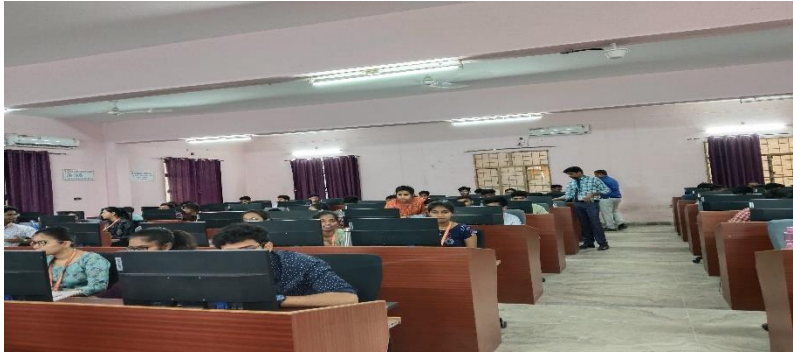
22-03-2024, 9:20 AM – 12:40 AM (IT &CSE: Room No.1012)