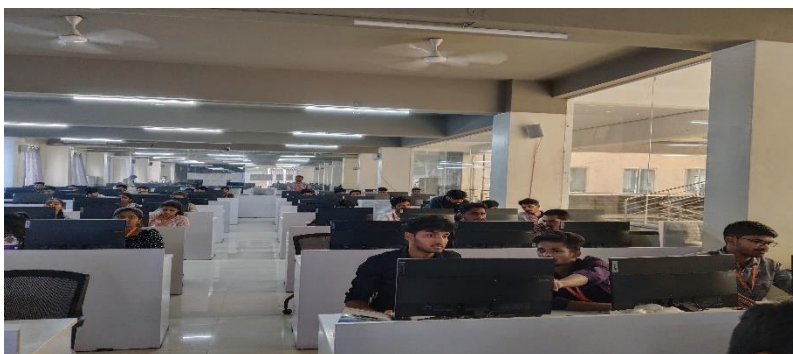
22-03-2024, 1:20 PM – 4:30 PM (ECE: Room No. 7111)