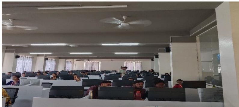
22-03-2024, 9:20 AM – 12:40 PM (CSE: Room No.7112)