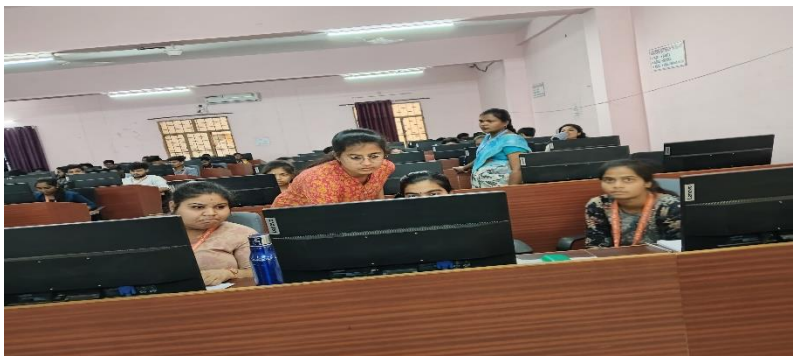
22-03-2024, 1:20 PM – 4:30 PM (CIVIL, EEE & MECH: Room No. 1012)