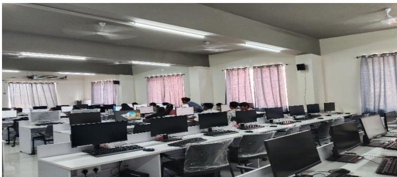
22-03-2024, 1:20 PM – 4:30 PM (ECE: Room No. 7110)