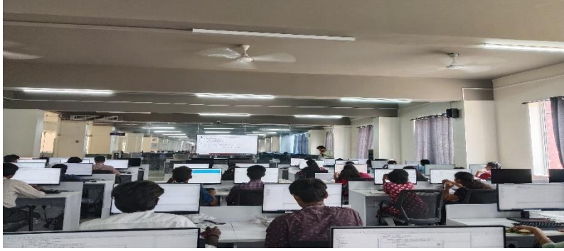
22-03-2024, 1:20 PM – 4:30 PM (ECE & CSG: Room No. 7112)